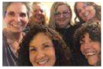
The Faces of ED RNs