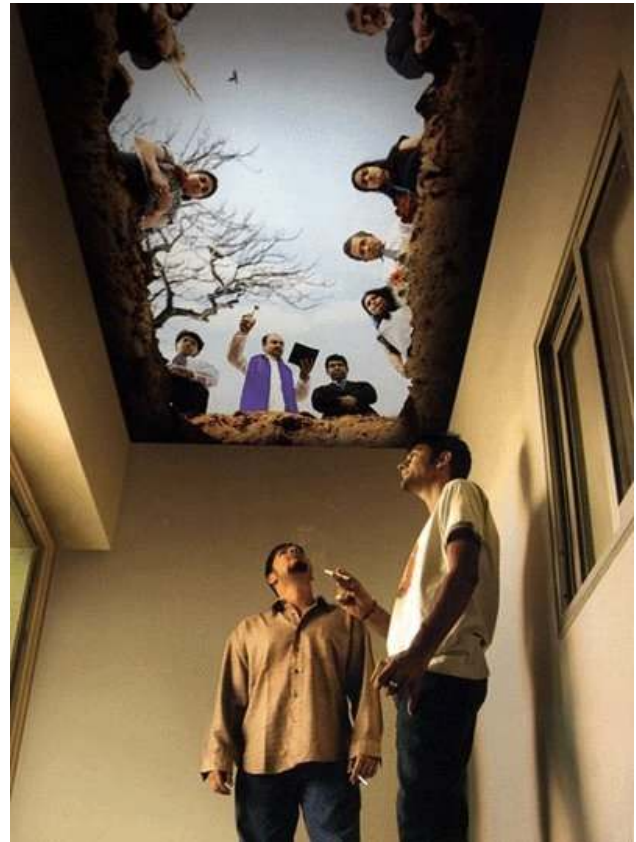
Clever mural on ceiling of smoking room shows another way to do health education.